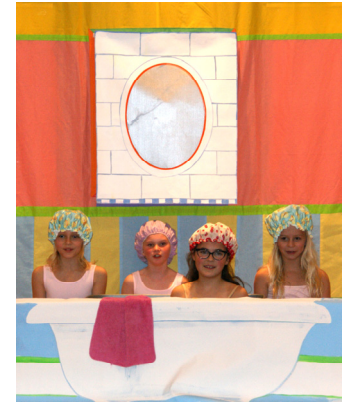
Bath Time scene from show

being addressed in the album's songs. With its adorable sets and snappy songs, this touring show premiered at the New Canaan Library, TUNES IN TIMES SQUARE, and the Autism Speaks Walk in Waterbury in Spring 2015. The 2015-16 season was kicked off with performances at Country Children's Center in Katonah and Ridgefield Library. We are looking forward to performing this show at schools, special needs events, hospitals, and libraries. For booking recommendations or requests for 2016, contact us at info@magicalmusic.org .