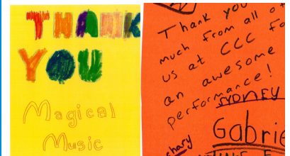
Thank you poster from Katonah's Country Children's Center