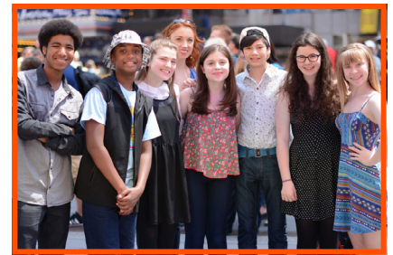
The cast members from Billy Elliot , Motown the Musical , The King and I , Sound of Music Live , & Raisin in the Sun

On May 3 rd Magical Music for Life™ held its fourth annual all-day sing-a-thon, TUNES IN TIMES SQUARE in New York City. This event was the biggest to date with more than 120 performances and 48 Broadway/professional actors. "THANK YOU" to the singers, dancers, Broadway and TV performers, donors, volunteers, and thousands in the audience who made it such a terrific event. In keeping with our mission to "use music to better the lives of children," the money raised at this event is funding the